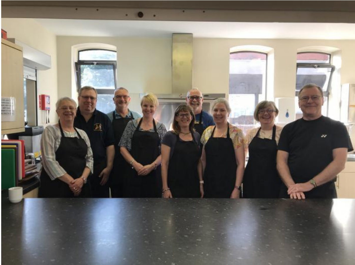
The SOS Group serve the Easter breakfast each year to raise funds for Whitechapel Mission

SOS is a group of likeminded couples and individuals all who have the same love of food.