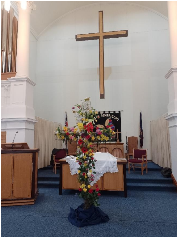
Church stewards also oversee arrangements for dressing the Easter cross

Appointed by and reporting to the church council are church stewards and our leadership team, on which the church stewards are represented. The leadership team are tasked with guiding and co-ordinating church and community centre activities in line with our mission and values. The church stewards ensure the smooth running of the weekly Sunday services and provide a communications link between the minister and congregation.