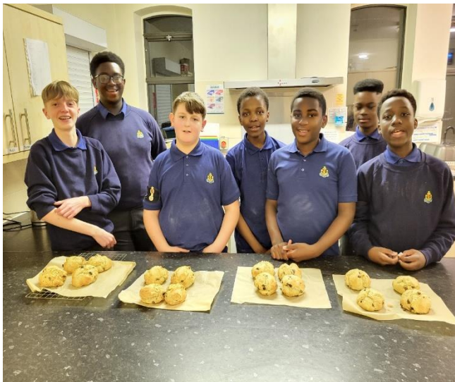
Company and Senior boys stand proudly with their hot cross buns.

Boys' Brigade numbers are generally steady, but we always need more, especially younger boys - a difficult thing when there are so many demands on boys' time throughout the week. New members are always welcome and can stem from siblings, friends or school.