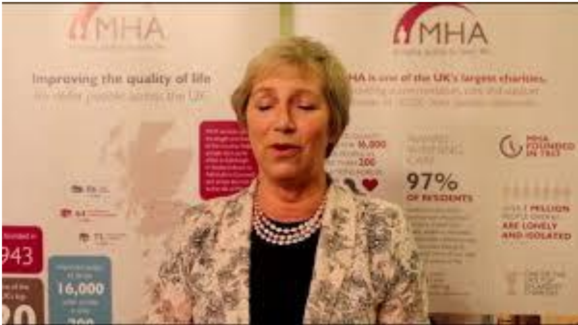
Pam Rhodes in an MHA video