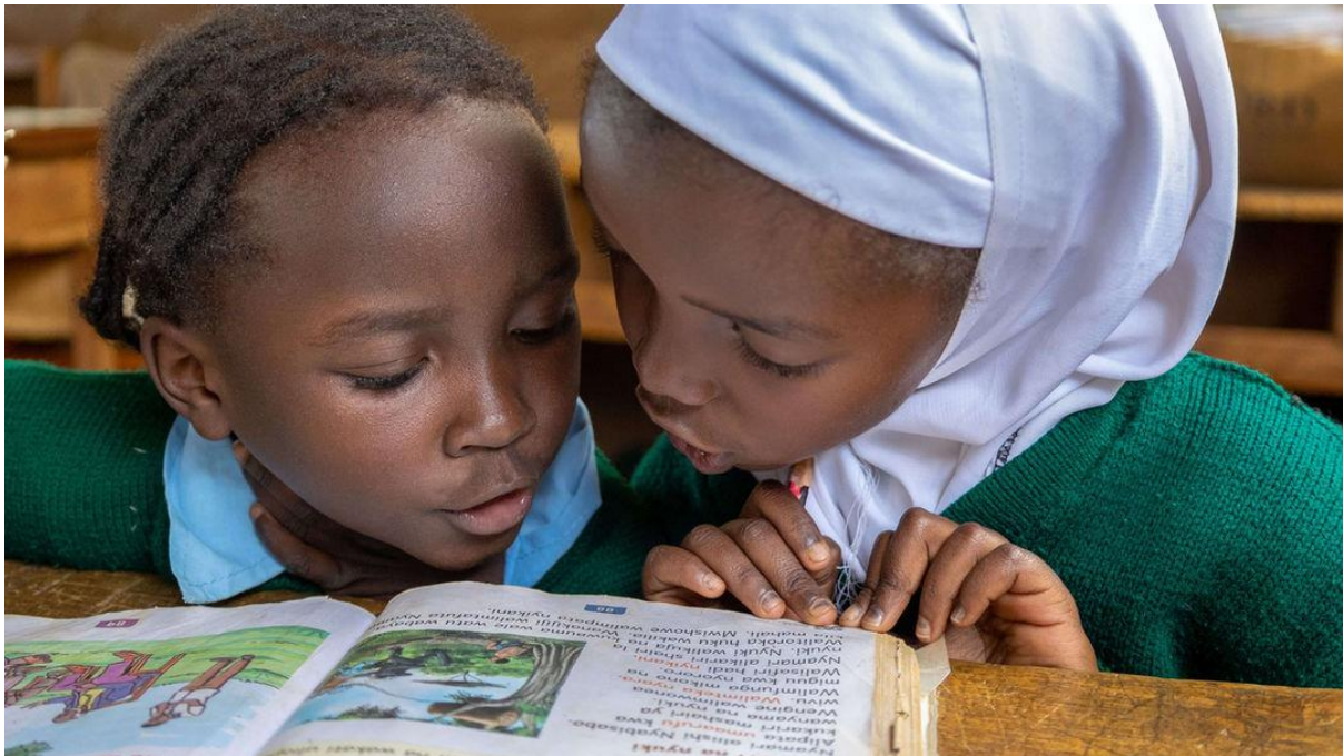
Karibuni Children: Transforming young Kenyan lives

underserved communities from accessing education for their children.