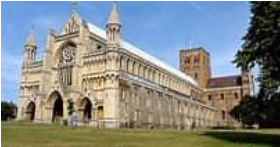
St. Albans Abbey